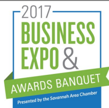
Exhibit at 2017 Business Expo

Leadership Savannah seeks to inspire leadership growth by providing learning experiences that lead to a better understanding of our community and preparation for meeting challenges of the present and future. The program will consist of monthly interactive sessions with top community experts beginning September, 2017 and will conclude June, 2018.