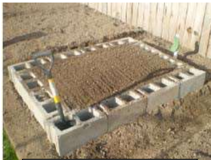
Cinderblock raised bed