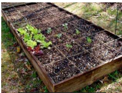
Wood raised bed

Raised beds can be constructed from wood, cinder blocks, stones, or even metal sheeting. To keep costs down for your garden, try to find these materials second hand. Wooden raised beds are the most common, and will be explained here, but a simple Google search will provide instructions for building beds with other materials.