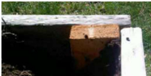
2x4 used for corners

Align each 2x4 piece of wood onto the ends of the 4' boards. Drill about 5 screws into place. Then hold an 8' board so its end is flush with the 4' board, and insert screws (from the outside of the frame) through the 8' board into the 2x4 piece and into the end of the 4' board. Pay attention to where the screws are line up to avoid screws running into each other. Repeat on all corners.