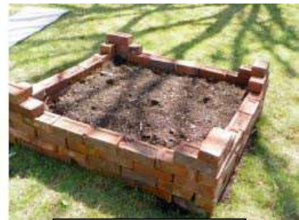
Brick raised bed