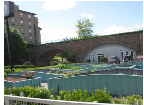
The SCAD community garden uses recycle shipping containers for beds.